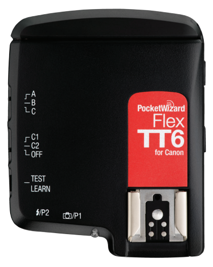
Available for: Canon F-TTL II